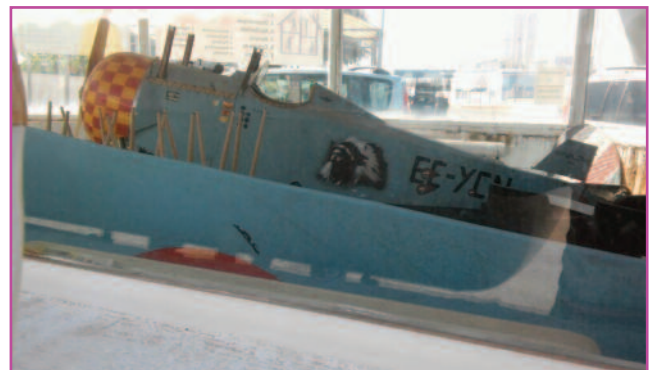
Abandoned aircraft at Els Poblets