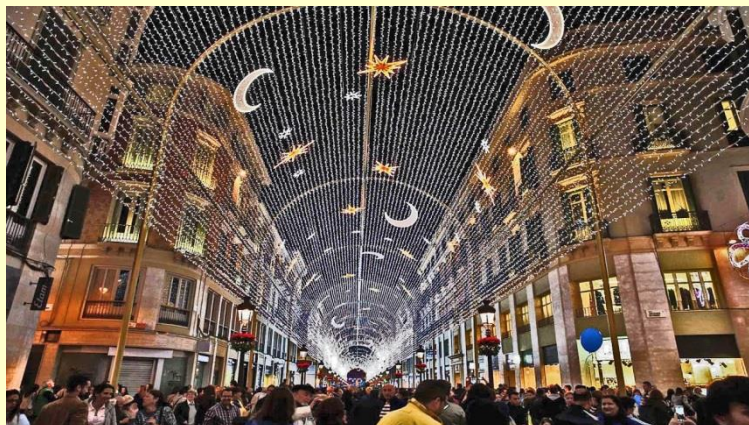
and Malaga Christmas lights

There will be a special Gala Christmas Day Lunch.