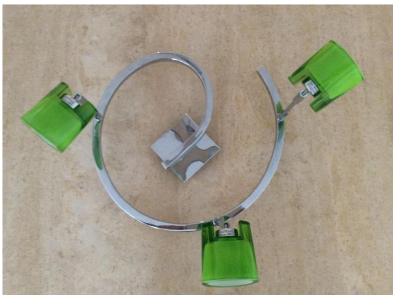
Light fitting €30

Contact: 966427467 (Dénia) 629690722 Chris Whitehead