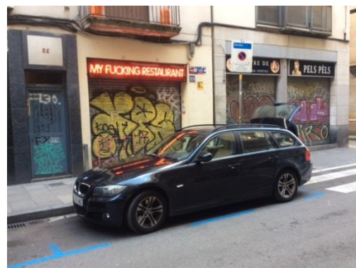
Delightfully named restaurant