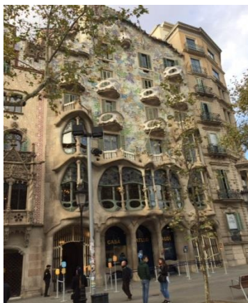
The Gaudi house