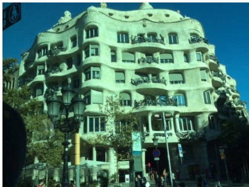
The Gaudi apartments

Please view some of the photographs which have been sent to me: