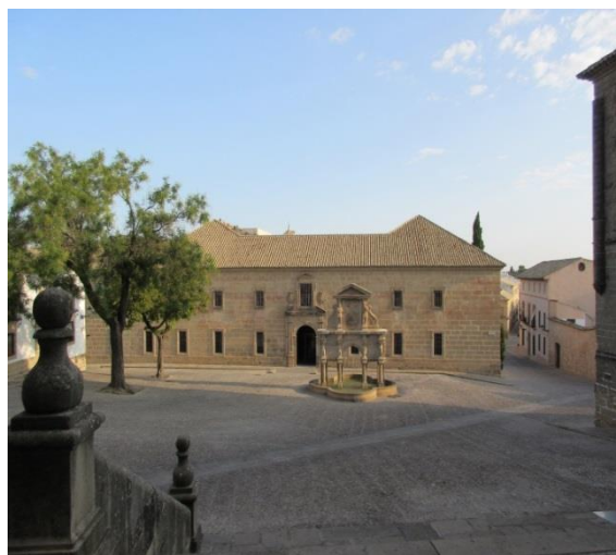
Baeza University Building