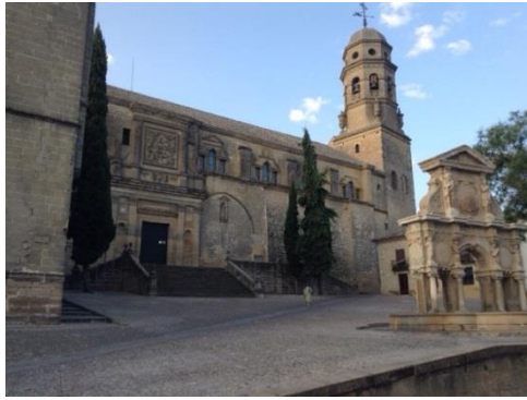
The Cathedral in Baeza