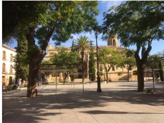
The peaceful plaza in Ubeda

This was virtually destroyed during the Spanish civil war and took 20 years to rebuild.