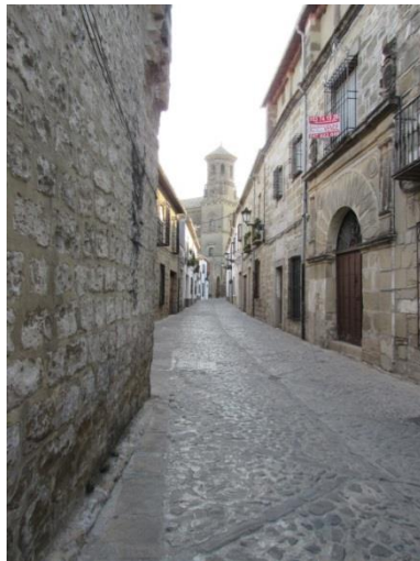
Baeza Old Town