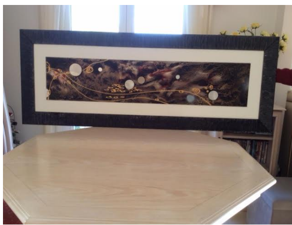
Modern painting (good condition) black textured frame. 148 x 55 cms €15