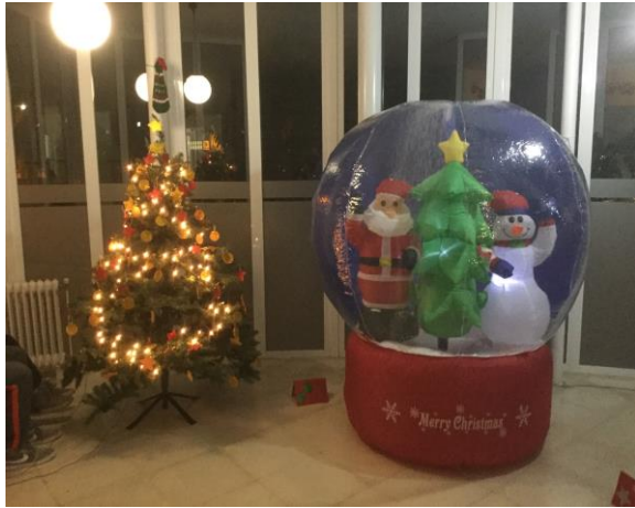
A snow globe in the foyer donated by Help of Dénia