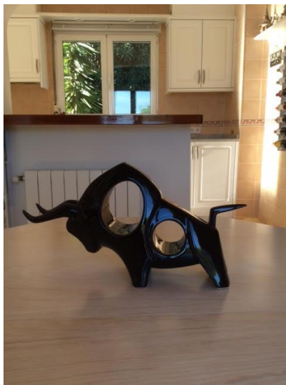
Black Bull (new). €15