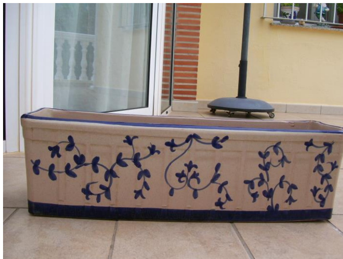
2 ceramic window boxes 22 inches long 6 inches wide 10 euros each.