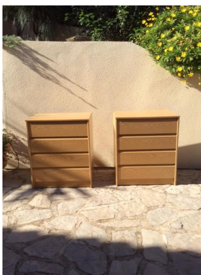
2 x chests of drawers (in good condition). 70h x 60w x 45d cms. €15 each