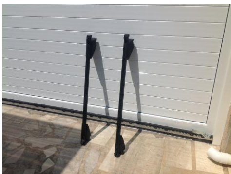
Citron Cactus roof bars 100 euros (over 200 euros new)