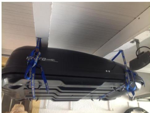
Hapro roady roof box 100 euros ono. ( check out the prices on Amazon)