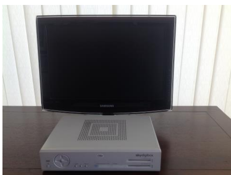
19" Samsung TV plus sky digi box 50 euros