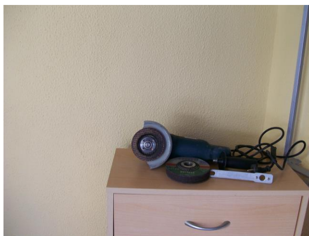
Black and Decker 115mm angle grinder with 6 discs 25 euros