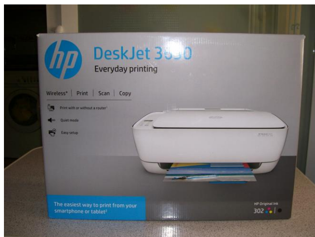
HP Printer 25Euros

Contact: Norma = normablanche@hotmail.co.uk