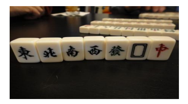
WINDS, ARROWS OR DRAGONS

There is a legend that the famous philosopher Confucius invented the game, but that has not been verified. Part of the reason for this myth is that historians have noted that the three dragon tiles agree exactly with Confucius ' mentioning of the three noble virtues.