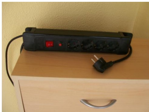
Four Plug extension lead 5 Euros

Phone Maureen 966433487 I live in Dénia near the old hospital